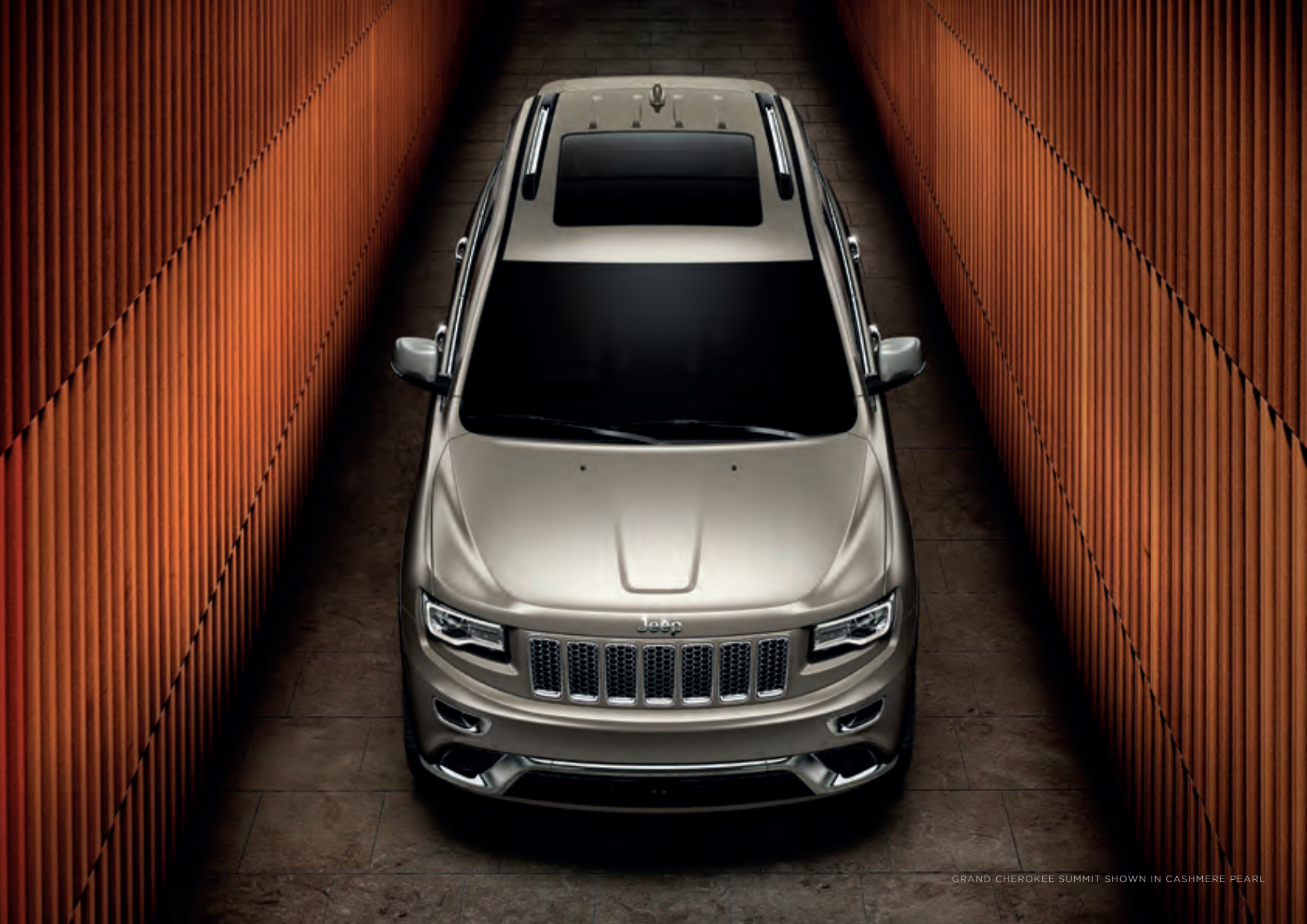
GRAND CHEROKEE SUMMIT SHOWN IN CASHMERE PEARL