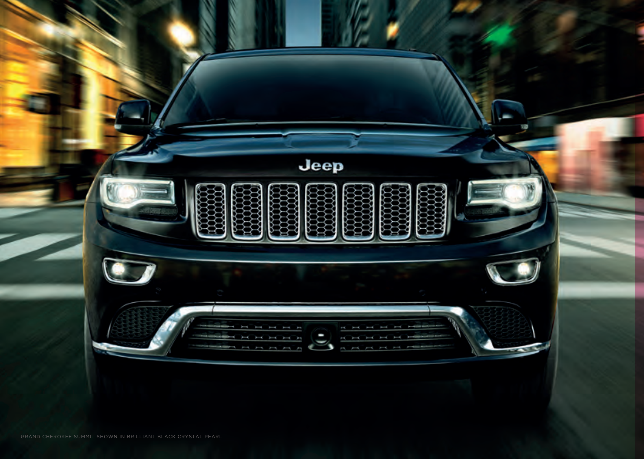
GRAND CHEROKEE SUMMIT SHOWN IN BRILLIANT BLACK CRYSTAL PEARL