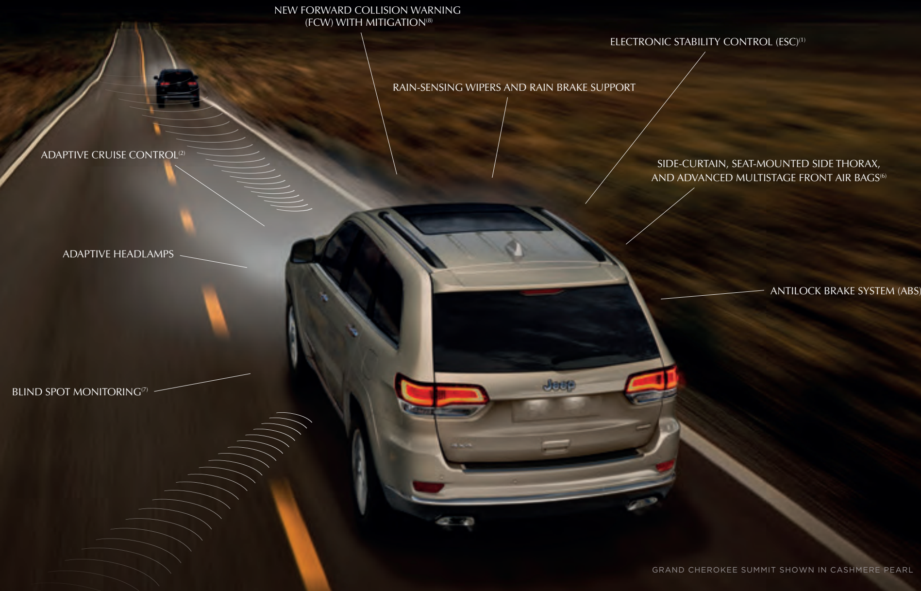
GRAND CHEROKEE SUMMIT SHOWN IN CASHMERE PEARL

This available system detects objects in front of the vehicle, providing an audible warning when you're too close for comfort.